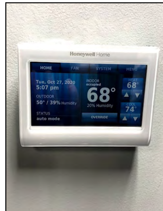
New web-enabled thermostat