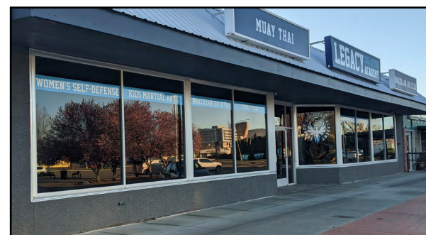
Storefront window before (top) and after (bottom).